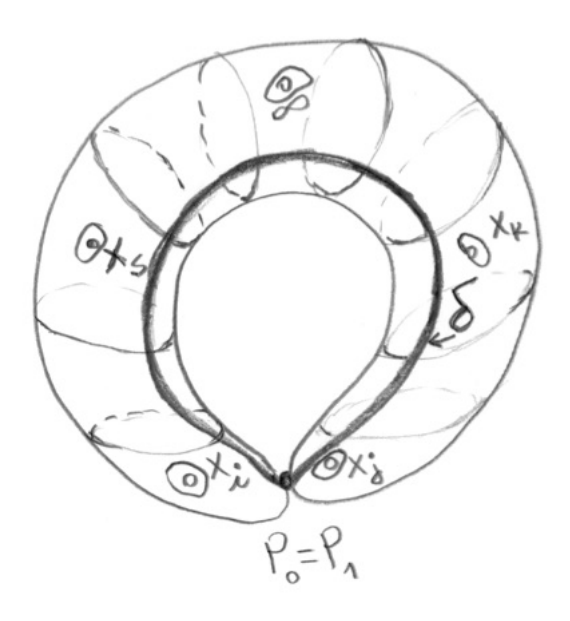
Figure 3.1. The singularized algebraic curve \Gamma_h^{sing} .